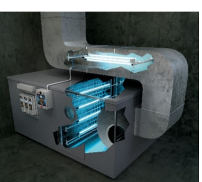
AHU / RTU & Airstream Disinfection